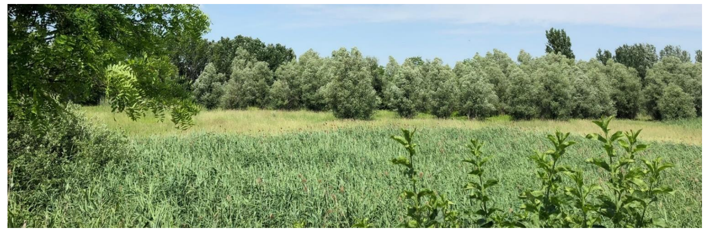
Site of planned water retention lake where rainwater falling on the settlement will be collected, situated just outside the village of Bátya. The wetland used to be a lake with permanent open water surface, but is currently dry.

In Bátya, vulnerability to droughts, heat waves and extreme precipitation is already being addressed through a nature based cross-cutting solution. It involves the revitalization of a former clay-pit as a wetland, into which rainwater collected from parts of the settlement will be diverted. With this recreated pond of 1 ha, extreme high precipitation can be retained to recharge the groundwater level, and an open surface lake will help regulate micro-climate, and provide other ecosystem services such as recreation for people and habitat creation for wildlife.